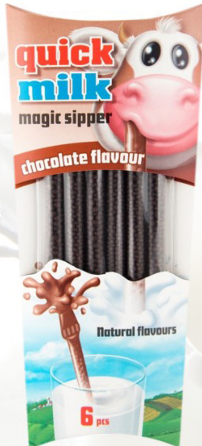
QM6 - 6x6g