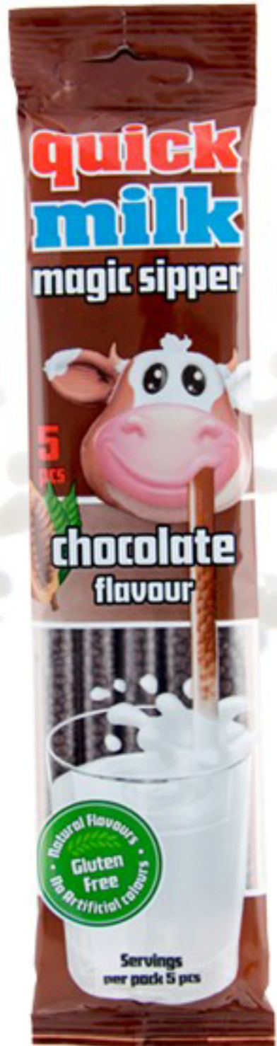
QM5 - 5x6g

Quick Milk Magic Sippers are available in 4 different type of packing: QM5, QM6, QM10, QM10+3 Available in chocolate, strawberry, vanilla, chocolate-banana, caramel, banana, biscuit, coconut-chocolate, forest fruit, fruity cereal flavours. Based on our experience the top 5 flavours are: chocolate, strawberry, vanilla, banana, chocolate-banana