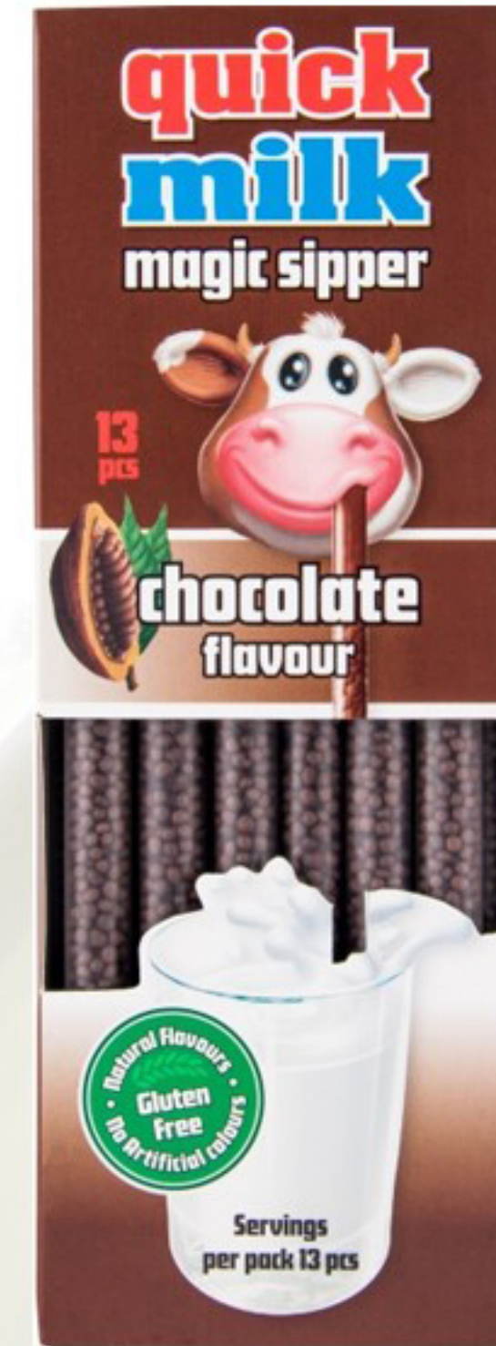
QM10+3 - 13x6g