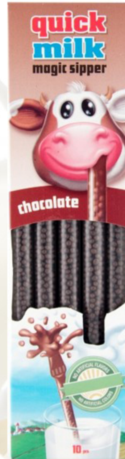
QM10 - 10x6g